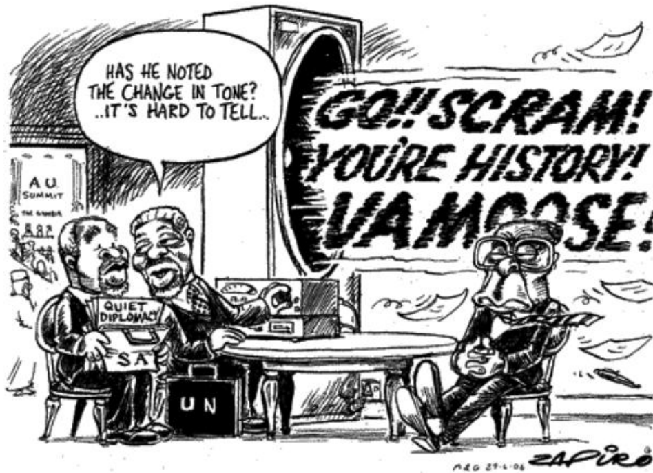
Appendix 4: Bob, you're time's up!