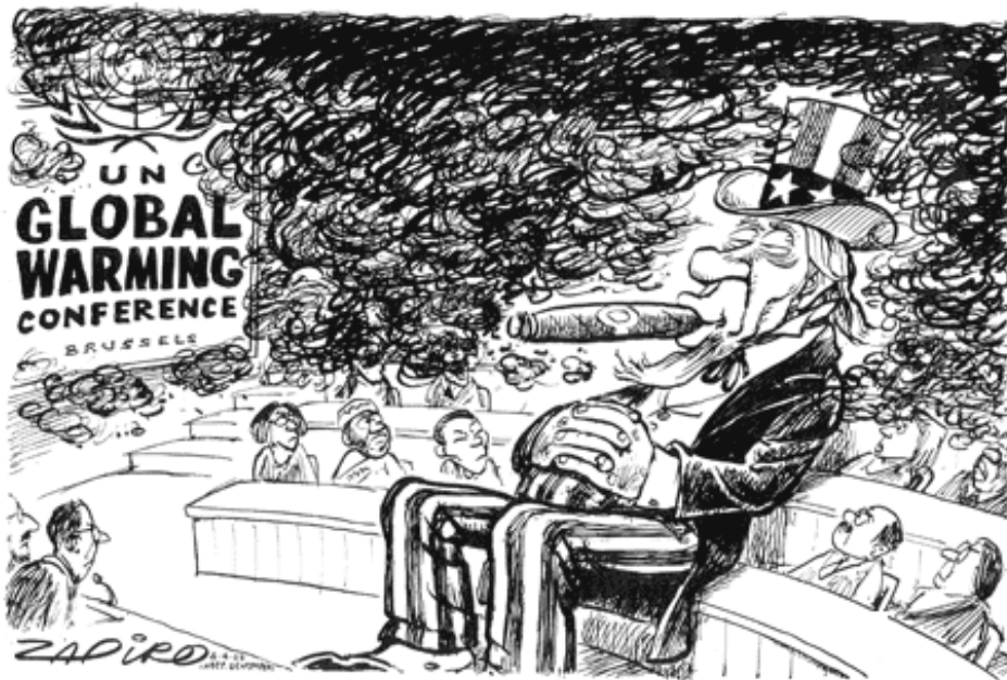
Appendix 2: "Global Warming Conference"

Source: Zapiro, Mail and Guardian 2008/06/17