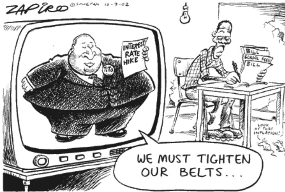
Appendix 1: "We must tighten our belts"