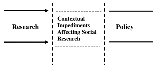
Fig. 2. Research to policy

It is assumed that data from Africa usually produce socially structured misunderstandings (Russell and Mugenyi 1997). This is basically because social science research in Africa is often described as armchair empiricism. The originality in most data is usually in doubt mainly because