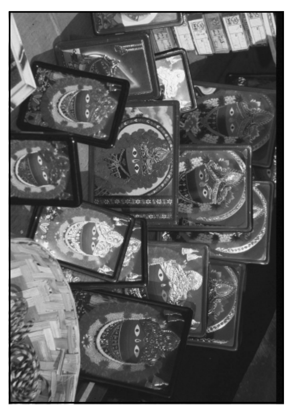
Fig. 1. Paintings of goddess Tarini for sale Ghatgaon, spring 2002