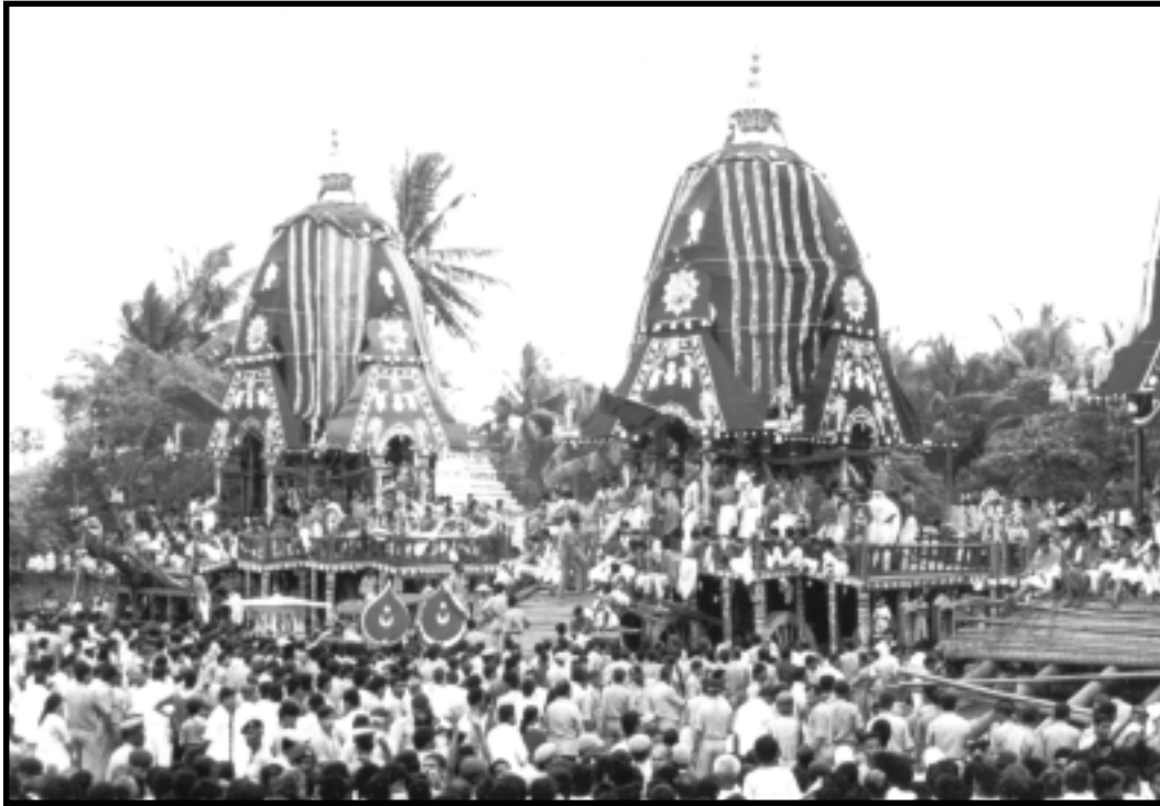
Fig. 4. The Raja of Puri, sweeping Subhadra's chariot at the 1994 Rathayatra. After this symbolic task is completed, the ramps will be dismantled and wooden horses attached to each chariot. This work is already in progress on Balabhadra's chariot.

of the bathing ceremony. 40 The ritual of bathing, painting, and dressing the images represents their annual rebirth prior to the cart festival. At the beginning of the Navakalevara , four daita chiefs — from the four divisions of daitas serving Lord Jagannatha, Subhadra, Balabhadra and Sudarshana—are presented with silk Gitagovinda cloths of approximately eighteen feet in length, or, in the local system of measurement, twelve hata (hands). The remaining compliment of daitas , thirty-two in all, 41 receive four to five hatas ( charihata ) of the same fabric. 42 The Vishwakarma carpenters receive cotton and silk saris from the Raja of Puri as “a symbolic authorization of the king to begin work.” 43 When the proper tree has been selected for each of the four images, it is circumambulated seven times, sprinkled with holy water, applied with sandalpaste, offered flowers, and finally wrapped with a “new cloth.” Mishra's photograph, cited above, documents the 1969 Navakalevara in which the wooden log ( daru ) is protectively wrapped in the silk Gitagovinda cloth, revealing