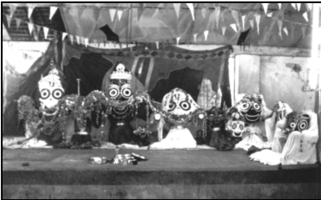
Fig. 2. The deities Jagannatha, Subhadra and Balabhadra dressed in cloth at the 1995 Rathayatra celebrated in Jagdalpur, Bastar district, Chhattisgarh. As seen here, images from numerous Jagannatha temples in the Jagdalpur area are installed collectively in a large pavilion near the king's palace for the duration of the Rathayatra. There have been strong historical and political connections between eastern Chhattisgarh and western Orissa, and, in turn, with coastal Orissa and the development of the Jagannatha cult.

Known locally as the "Gitagovinda khandua," the Gitagovinda textile is an extraordinary silk cloth with verses produced by the weft ikat technique. Organizationally, this textile conforms to other Indian draped cloths such as the sari, with a clearly defined central field, borders, and decorative end panel ( pallu ) with its three alternating colours that correspond to the dominant colour of each of the three chariots: green for Balabhadra, red for Subhadra, and yellow for Jagannatha. Inscribed Indian textiles are rare; therefore their presence typically signals a symbolic dimension. For example, block-printed textiles with the repeating Vaishnavite salutation "Shri Ram, Jai Ram, Jai Jai Ram" are widely available at temple sites to be purchased by pilgrims as a religious memento, or they may be worn by priests, as during the 1994 Rathayatra celebrated locally at Raikia, Phulbani district, Orissa. The inscription on the Gitagovinda cloth