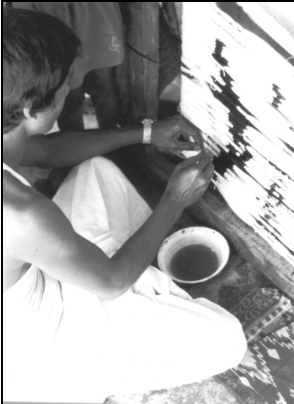
Fig. 3. A young man in Nuapatna, a large village specializing in silk ikat, prepares weft ikat stretched on a wooden frame. As the finished cloth will have many colors, he is painting a dye directly on to specific portions of the weft. These threads will later be bound to resist an immersion dye-bath. The cloth at his feet serves as a pattern guide.