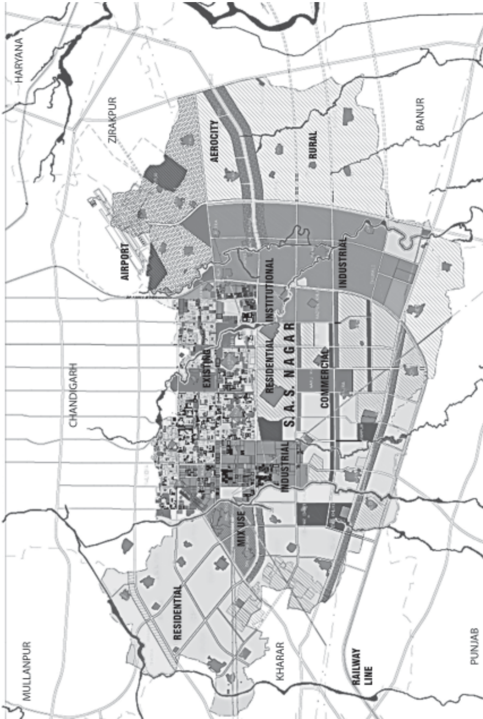
Fig. 3. Local planning area S.A.S. Nagar