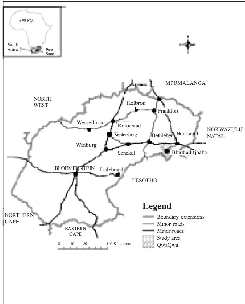
Fig. 1. Location of the study area

cultural sector with a well-established farming community, the creation of entrepreneurial opportunities, food security, creation of job opportunities in agriculture and supporting industries, and an increase in the general standard of living of the people of QwaQwa. Farm planning and the provision of infrastructure were done by Agriqwa . Technical and extension officers employed by Agriqwa provided emerging farmers with technical, financial, administrative, marketing and managerial services. The following