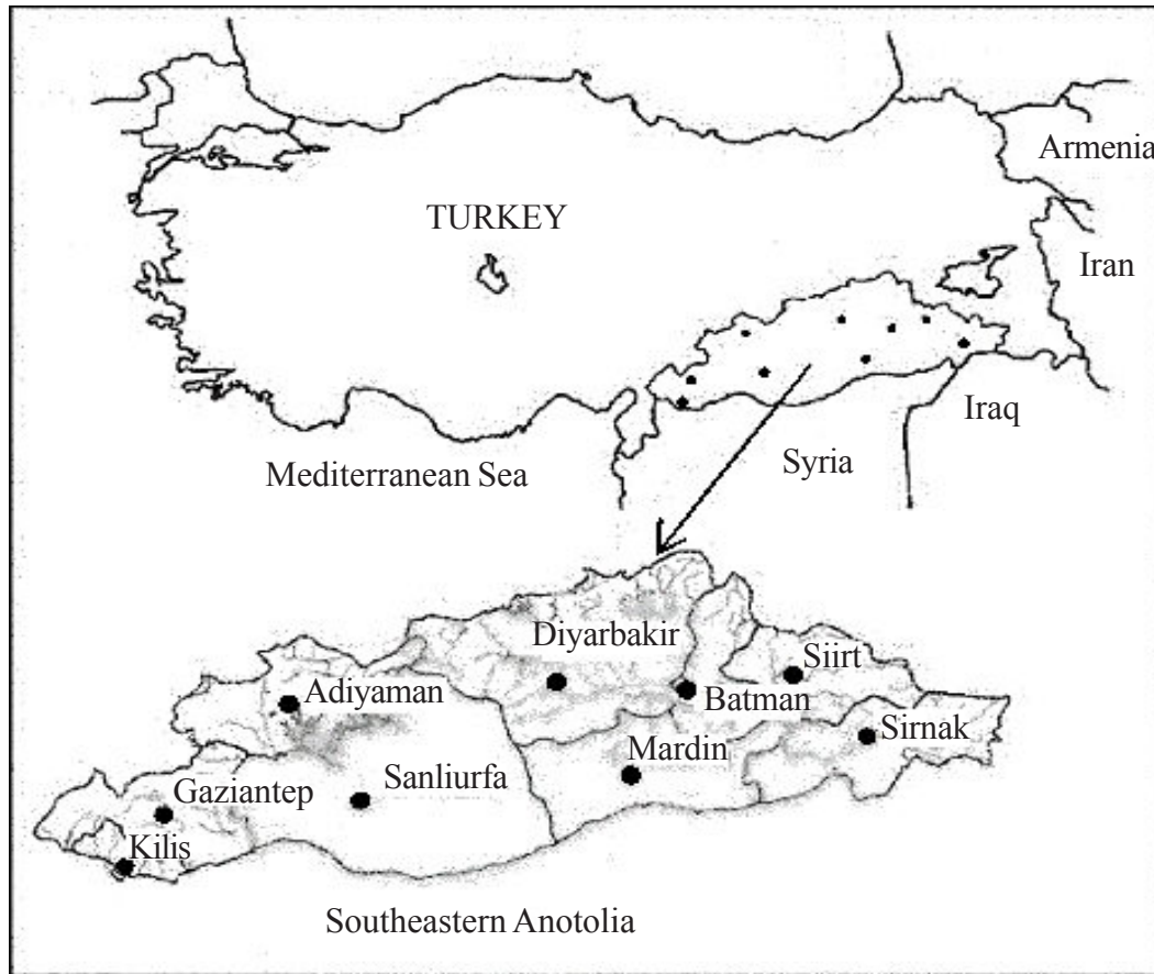
Fig. 1. Map of the Southeastern Anatolia Region of Turkey