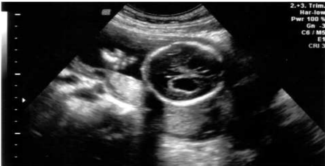
Fig. 2. Longitudinal scan of the fetus at 16 weeks gestation. Arrow points to markedly bilateral choroid plexus cyst.

This was the first pregnancy of a 26-year-old woman. Routine ultrasound scan at 16 weeks revealed an echogenic bowel (Fig. 1) and choroid plexus cyst (Fig. 2). There was no evidence of structural abnormality in the fetus. Direct chromosome preparations from the amniotic fluid culture showed [46,XY,der(1) del(1)(p36.1→pter) dup(8)(p21.3→pter) t(1;8)(p36.1; p21.3)] (Partial Monosomy 1p Partial Trisomy 8p) (Fig. 3).