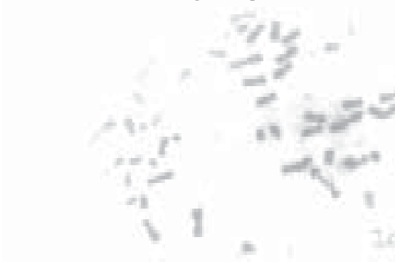
Fig. 2. Breaks