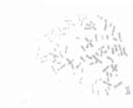
Fig. 6. Polyploid