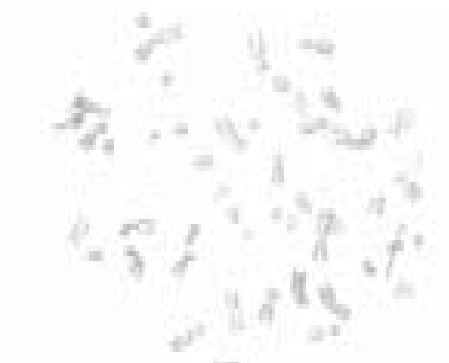
Fig. 4. Metaphase showing dicentrics