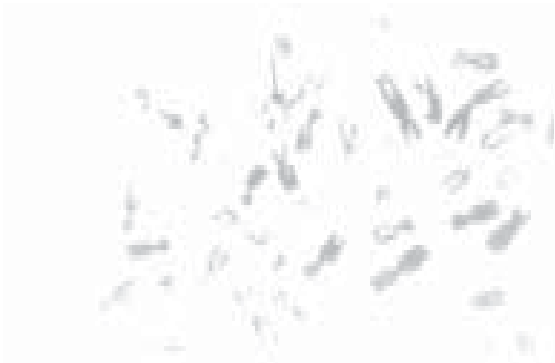
Fig. 1. Gaps

In the control group data from nonsmokers (Control - I) was compared with smokers (Control- II) data. Chromosomal aberrations were high in the smokers when compared to nonsmokers. The difference in the total chromosomal aberra-