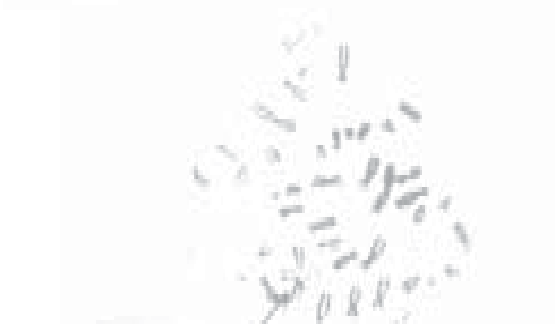
Fig. 3. Metaphase showing exchanges