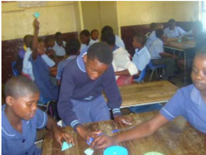
Fig. 2. Learners in action

With the assumption that these learners had been exposed to fractions before, although not addition of fractions with different denomina-