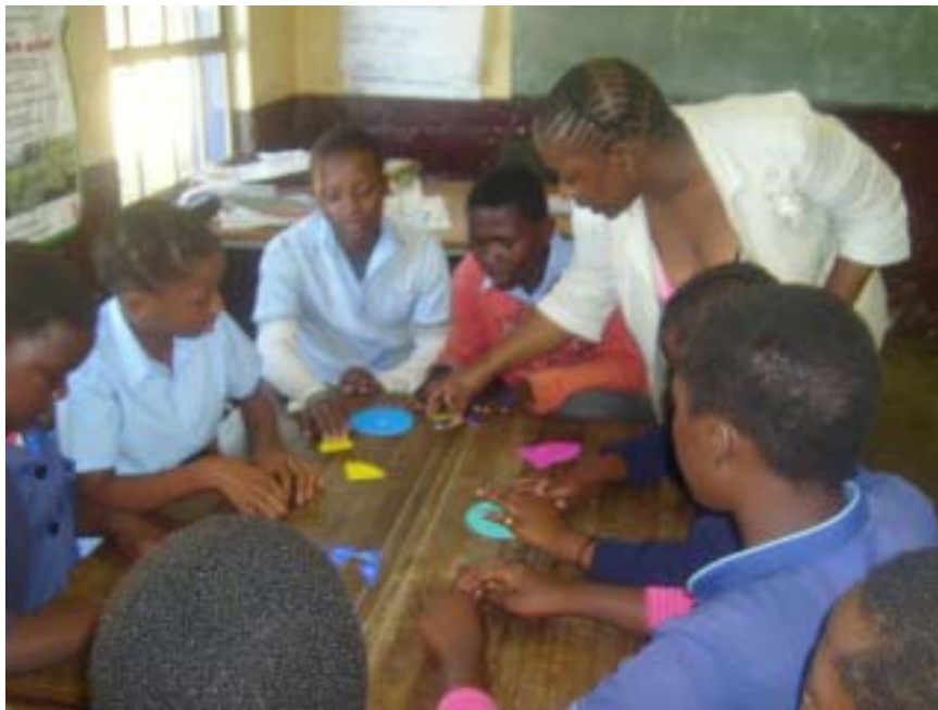
Fig. 1. Learners actively engaged in activity 1

Borrowing from (Vygotsky 1978; Breen 1992) children learn from people around them and their surroundings. Vygotsky further claimed that central to the process of learning is the role played by society in the development of higher cognitive situations. She also contends that learners work with their peers in collaborative situations or they complete tasks and/or activities with the educator as a facilitator (Vygotsky 1978). Also relevant to Vygotsky's views, as ar-